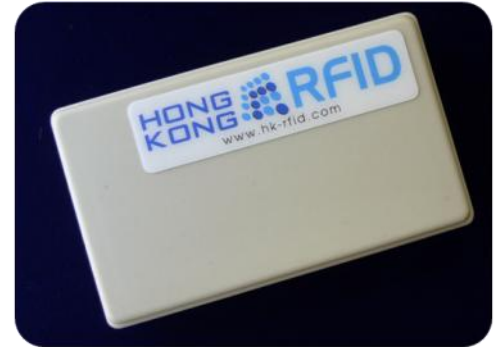
Special Active RFID Tag