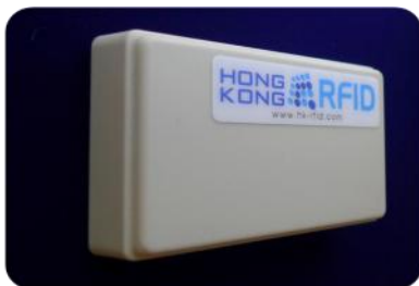
Special Active RFID Tag

With advanced testing of stability and longevity on the Active equipments, RFID technology will bring management in the construction industry more control over safety in sites . Wireless transition integrated with database would make our device more efficient and accurate. This new safety device can monitor safety condition of labors and contractors and provide security and emergency control for dynamic and working environment.